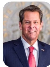
BRIAN P. KEMP Governor State of Georgia

“In the years to come, we will advance initiatives that spur job growth in all parts of our state, lower taxes and insurance premiums for Georgia families, strengthen rural communities and keep our children safe. Together, we will put hardworking Georgians first and ensure that our best days are always ahead.”